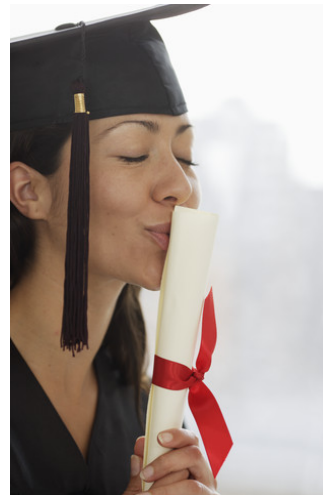
The College Access Initiative is funded by the Jane's Trust Grant.

This initiative will reach underserved populations in all corners of the state including the North Country, Lakes Region, Seacoast, Western corner and the Southern region.